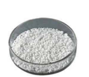
Silver-based inorganic antimicrobial powder (Zeomic Type DAW502 Silver Zeolite A)