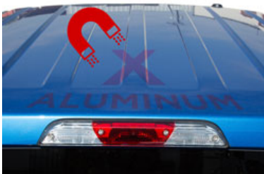
Aluminum Body is Not Magnetic

*Please note that the MMP-GM-SLVD-2019-LD is designed for trucks with incandescent 3rd brake lights ONLY. Operators with LED 3rd brake lights will require the MMP-GM-SLVD-2019-LD-LED. Incandescent mounting plates and LED mounting plates are NOT interchangeable.*