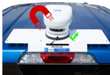
MMP-GM-SLVD-2019-LD Steel Plate is Magnetic

Applications: Hunting, fishing, off-roading, property management, security, search and rescue, farming operations and any other applications for which a roof mounted spotlight is needed for 2019 Chevrolet Silverado 1500 LD, 2500 LD, and 2500 LD model truck owners.