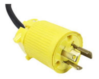
L5-15 Twist Lock Plug 15 Amp / 125V Rated