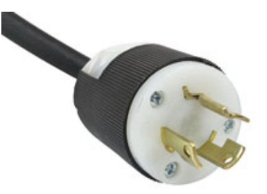
L6-15 Twist Lock Plug 15 Amp / 250V Rated