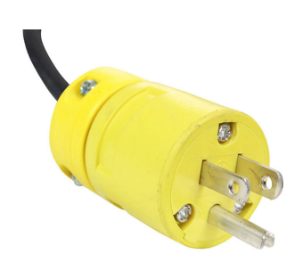
5-15 Straight Blade Plug 15 Amp / 125V Rated