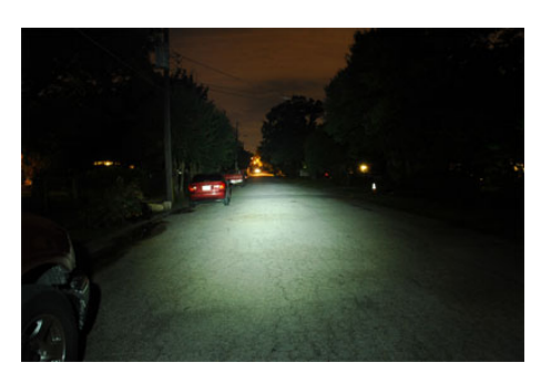
The same street illuminated with the LEDLB-8ET-M-16CC-1227, easily reaching distances of 90' in length and 70' in width. .