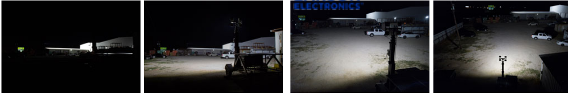
Click Images to Enlarge