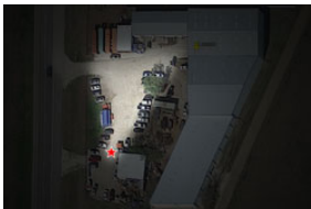
Area from Above

Network Cameras: Two security cameras provide operators with crisp, 1080p full-HD high resolution images. A 4.7-94mm varifocal lens automatically adjusts focus, providing operators with precise 20x optical zoom levels. Integrated long-range IR LEDs, with a wavelength measurement of 850 nm, enable the day/night cameras to see distances up to 492` under nighttime conditions. The units offload videos in MP4 format and features H.264 and MJPEG video compression. The PTZ cameras each measure a compact 14.38" x 7.12".