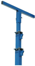
44" Mast Head for mounting lights and equipment Click Image to Enlarge

The LM family of telescoping towers feature a proprietary mast guidance system, which provide increased stability during high winds. Four 1,000 lbs hand crank leveling jacks are used for leveling. The jacks can be leveled by hand crank or attachment provided for power drills. These outriggers can be extended 2` out from the side of the trailer for added stability. When lowered to 13.5`, the mast can withstand winds up to 125 mph. Custom builds can be provided for higher wind speed resistance when fully raised.