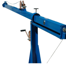
Mast folds over for transportation and when not in use Click Image to Enlarge

LED Light Fixtures: This solar light plant is equipped with four of Larson Electronics` GAU-LTL-60W-LED-24VDC high output LED light fixtures. Each LED lamp produces 8,100 lumens of high intensity light while drawing only 100 watts at 1.7 amps from a 24 volt electrical system. Six CREE® high output LEDs producing 1,350 lumens each are arranged in rows and paired with PMMA high purity optics to produce a well focused 24° wide spot beam that is ideal for providing far reaching concentrated illumination while still covering a substantial amount of area. We also offer optional optics with 10° spot, 38° narrow flood, 60° flood, and 90° wide flood beam spreads. The spot beams are tightly focused and are designed for high elevation mounting to achieve distance, making spot versions ideal for high mast and spots lighting. The flood beams are designed to provide more light over a larger area nearer the fixture, making flood versions ideal for use as dedicated work and area lights.