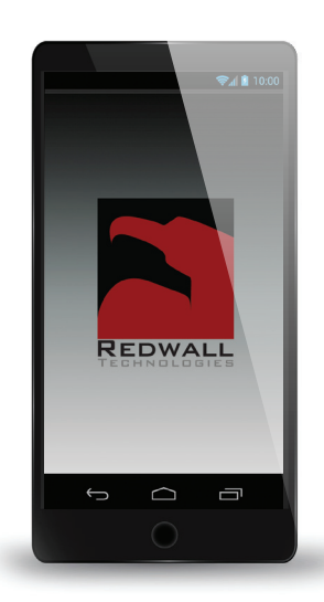
Redwall Mobile® consumes minimal system resources and users don't know the device is hardened with military-grade protection.

Cryptographic and temporal isolation ensure there is no possibility of contamination across modes. It is as if the user is carrying separate devices within a single device. Contrary to containerization where sandboxing or virtualization is employed, these methods cannot provide the level of isolation available in Redwall Mobile®. Those containerized solutions still leave sensitive data in memory, making them highly vulnerable. Dedicated devices like the Blackphone are not the answer, requiring users to carry multiple devices for different roles or different levels of security. Redwall Mobile® consolidates all the features of a military-