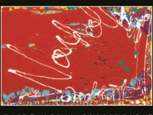
Naked Warhol - $6,000,000

THIS CENTURY'S WARHOL, and the most important ART REBEL of JACK ARMSTRONG IS