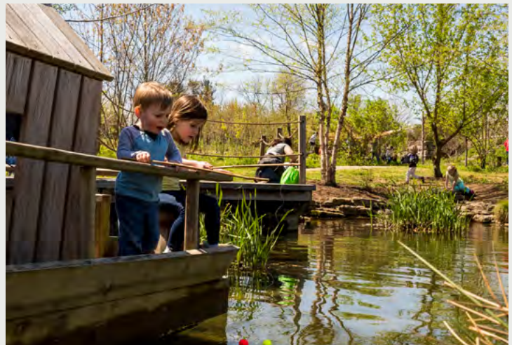
Children's Garden and Home Demonstration Garden at the Arboretum, University of Kentucky