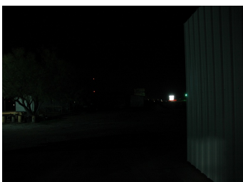
This photo shows an open parking lot lit only by ambient light at approximately 9:00 pm`.

A specially designed mounting system and quick change protective shield allows operators to use this unit as a blasting gun mounted light source that will stand up to abusive use. The protective lens is offered in polycarbonate or hardened glass materials. The polycarbonate lenses are for metal blast materials, while the glass lenses are for smaller abrasives.