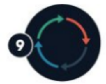
Maintain a Consistent Content Publishing Cycle