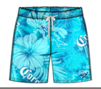
Style #: MPS13063 Style Name: Palm Fusion Description: Blue 100% Polyester Pool Short