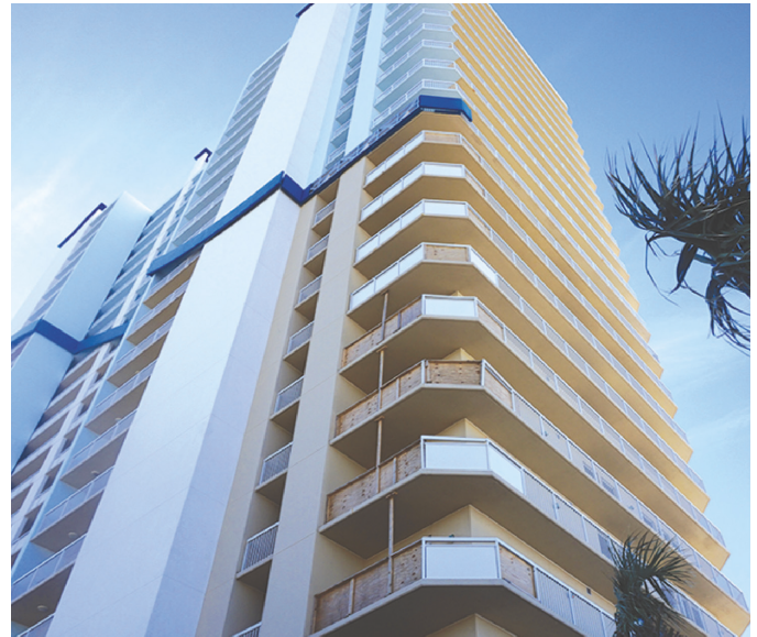
19- Story High-Rise Condominium Claim Hurricane Irma Insurance Company 1st Offer - $0 (under deductible) Claim Settlement Achieved by Altieri - $15,000,000 15,000,000% increase with the Altieri Advantage