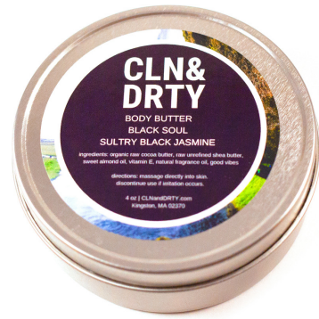
BODY BUTTER: BASIC WITCH $28