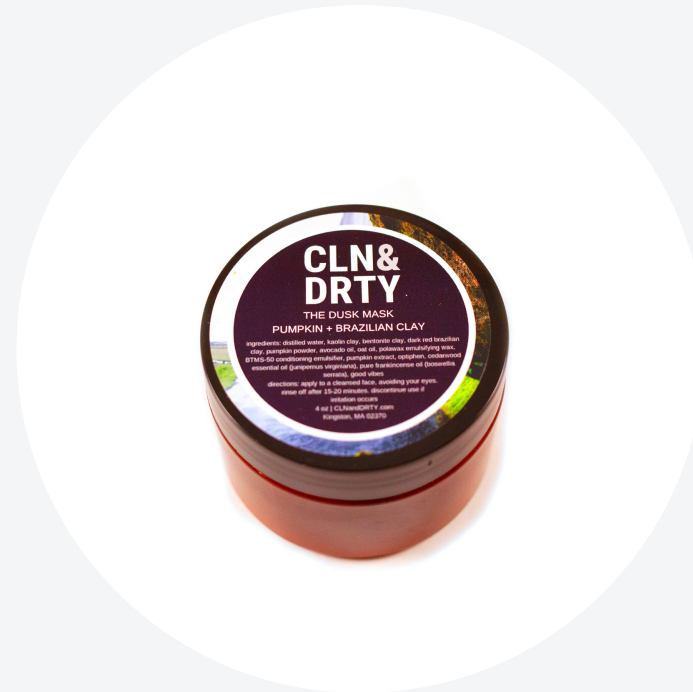
THE DUSK MASK $34

neroli: reduces inflammation and signs of aging | mallow and chamomile extracts: deeply soothing and skin calming | lactic acid: stimulates collagen renewal | glycolic acid: exfoliates to renew skin