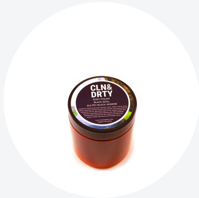
BODY POLISH: BLACK SOUL $30