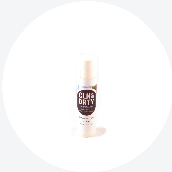
LIP BALM: BASIC WITCH $7