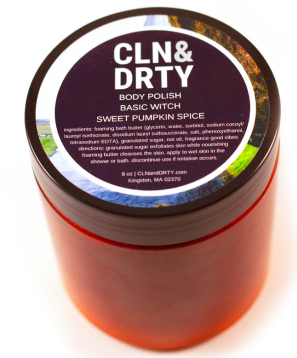
BODY POLISH: BASIC WITCH $30

organic raw cocoa butter: deeply hydrating and skin protecting | vitamin E: a powerful antioxidant that fights free radicals | shea butter: restores skin's elasticity