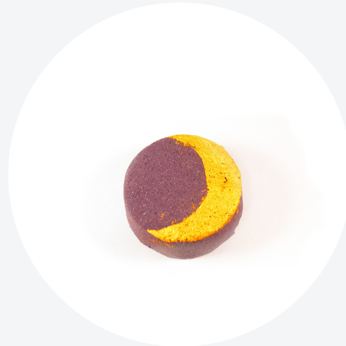
BATH BOMB: BASIC WITCH $8

organic raw cocoa butter: deeply hydrating and skin protecting | coconut oil: hydrates skin for up to 24 hours and improves elasticity | vitamin E: a powerful antioxidant that fights free radicals