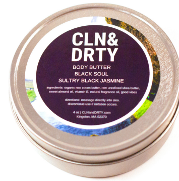
BODY BUTTER: BLACK SOUL $28

organic raw cocoa butter: deeply hydrating and skin protecting | vitamin E: a powerful antioxidant that fights free radicals | shea butter: restores skin's elasticity