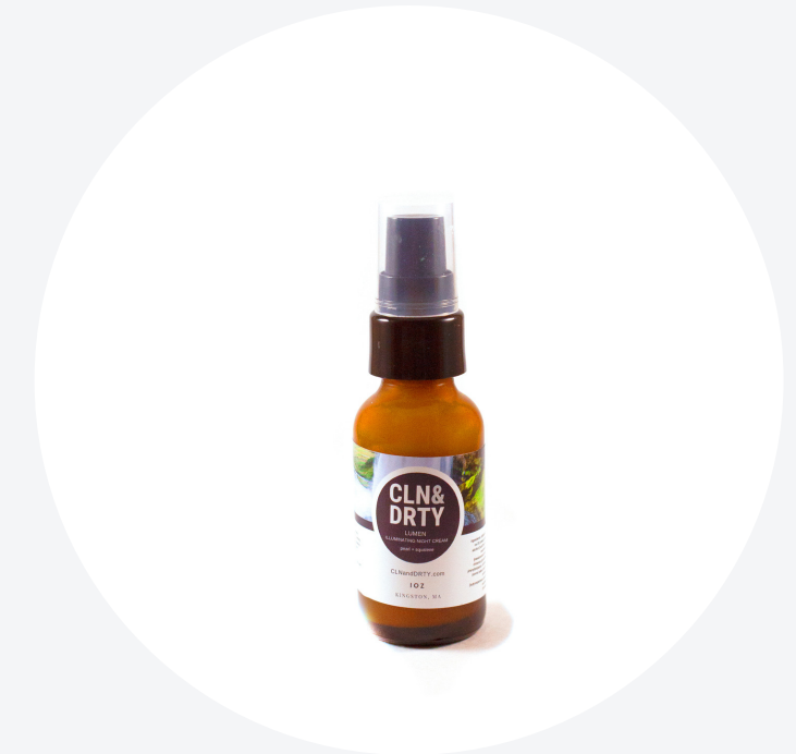
LUMEN ILLUMINATING NIGHT CREAM $72

purple brazilian clay: rich in magnesium, which slows the signs of aging | avocado oil: rich in fatty acids to deeply hydrate | pumpkin powder and extract: rich in antioxidants, protects skin's natural barrier