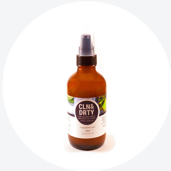
THE GOLDEN CIRCLE $58

brightening AHA essence 3% lactic + glycolic acid