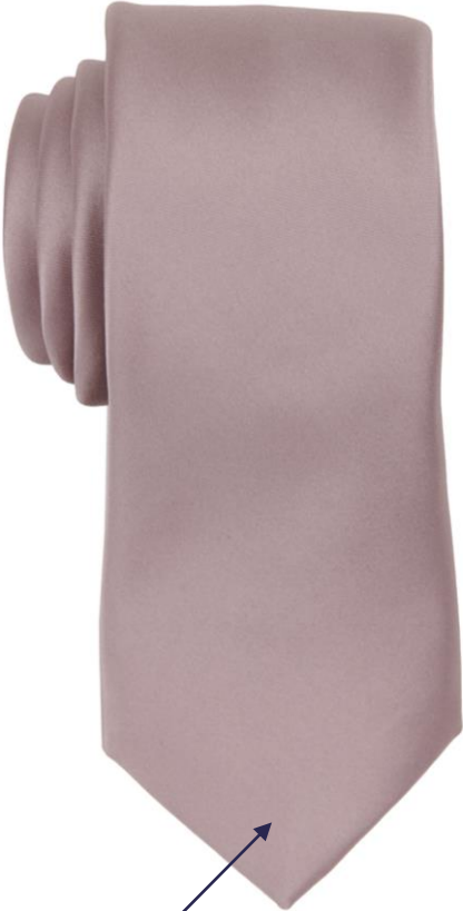
MEN'S TIES - Available in 58"(L) & 63"(XL)

18 colors in matching sets, finished with stain resistance .