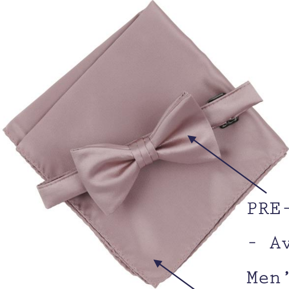
PRE-TIED BOW TIES - Available in Men's & Boy's