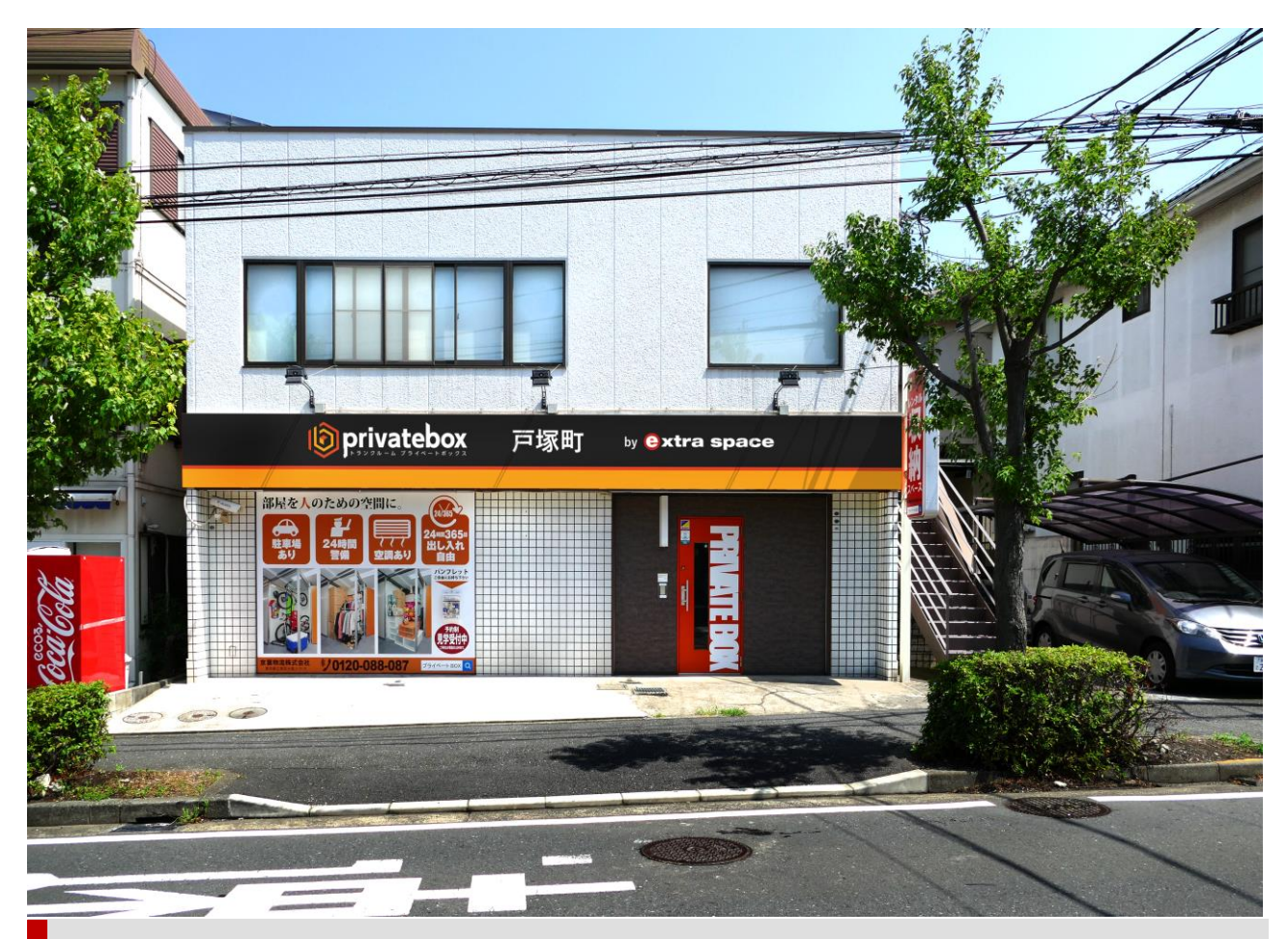
Private Box Totsuka-Cho storage facility, owned by Extra Space Asia, located at Yokohama.

Singapore, 11 September 2018 – Extra Space Asia has entered into a strategic venture with Keiyo Logistics to significantly expand the footprint of self-storage facilities in Japan. Extra Space Asia has committed to invest in self-storage facilities throughout Japan, and to work closely with Keiyo Logistics to become a dominant operator in Japan. Keiyo Logistics currently operates in excess of 75 facilities with over 6500 customers in Japan, primarily concentrated in Tokyo, under the brand "Private Box". Facilities owned by Extra Space Asia will be managed by Keiyo Logistics under the brand "Private Box by Extra Space". A leading pioneer of self-storage solutions in the Asia region, Extra Space Asia operates 33 facilities with over 12,000 customers across 5 countries (Singapore, Malaysia, Taiwan, Hong Kong and Korea) and is the largest self storage operator in the Asia region. The strategic venture between two of Asia's leading self storage operators will allow them to grow market share in a rapidly expanding industry.