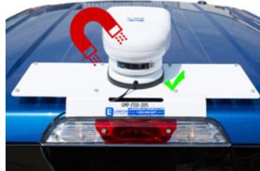
MMP-GM-SLVD-2017 Steel Plate is Magnetic

Applications: Hunting, fishing, off-roading, property management, security, search and rescue, farming operations and any other applications for which a roof mounted spotlight is needed for 2019 Toyota Tacoma truck owners.