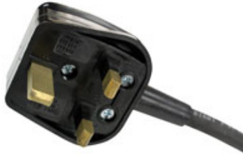
UK BS1363 Straight Blade Plug 13 Amp / 250V Rated / Internal Fuse