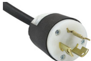
L6-15 Twist Lock Plug 15 Amp / 250V Rated