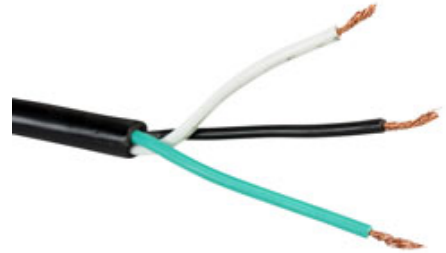
Flying Leads / Pigtail Wires

Wiring/Plug: This vapor proof hand lamp is equipped with 75 feet of 16/3 chemical and abrasion resistant SOOW cord that is fitted with an industrial grade cord cap for easy connection to common wall outlets. Plug options include standard 5-15 15 amp straight blade plug for 110V wall outlets with ground, standard 6-15 15 amp straight blade plug for 220-240V wall outlets with ground, NEMA L5-15 15 amp twist lock plug for 125V twist lock outlets, NEMA L6-15 15 amp twist lock plug for 240V twist lock outlets, British BS1363 13 amp fused 3-blade plug for United Kingdom outlets, or a two pin 16 amp rated Schuko plug with ground contact and socket for European outlets up to 250V. Alternatively, we can provide flying leads with no plug for hard wire applications or for operators who prefer to wire in user provided cord caps. Please choose pigtail option below for flying leads with no plug.