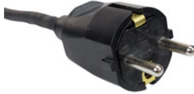
Intl Schuko 2-Pin Plug 16 Amp / 250V Rated / Grounded