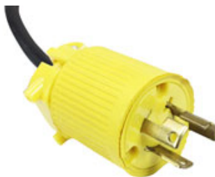
L5-15 Twist Lock Plug 15 Amp / 125V Rated