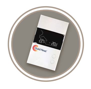
Thermostat that includes a floor heat sensor