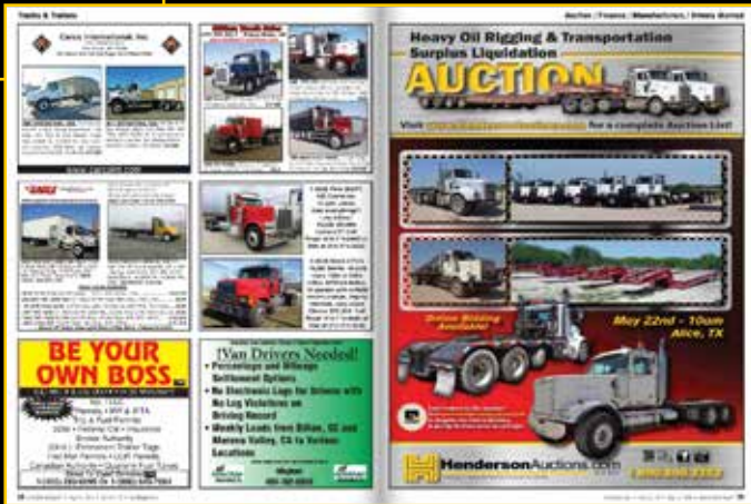
Truck Paper & American Trucker Full Page Ad