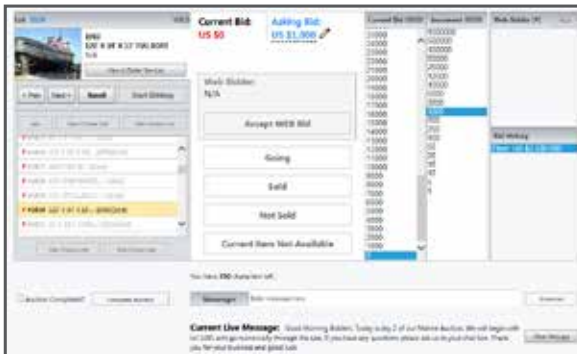
Online Ringman Screen

For domestic and international bidders unable to attend, Henderson Auctions utilizes an online auction day broadcast: this allows buyers to participate from the convenience of their office or homes. A convenience fee of an additional 2% will be assessed to internet buyers.