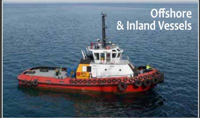
Offshore & Inland Vessels

August 25th & 26th - 9am Morgan City, LA