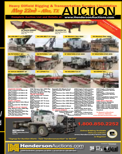
Tradequip International Full Page Ad