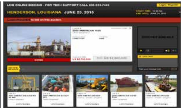
Online Bidder Screen