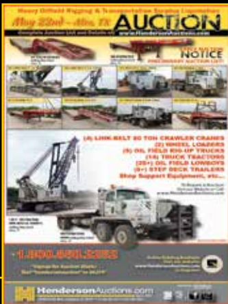
Middle East Equipment Magazine / e-blast