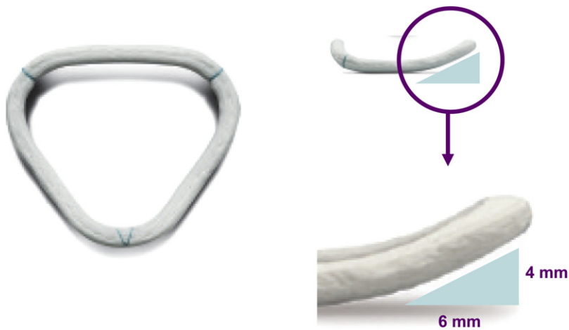
Figure 1. Myxo-ETlogix ring designed for patients with leaflet elongation historically treated with sliding plasty with risk of systolic anterior motion. Ring has longer anteroposterior diameter (typically 6 mm) to accommodate larger leaflets, corresponding to typical posterior leaflet height reduction from sliding plasty. P2 segment of ring has 4-mm displacement into annulus. Net effect of these two changes moves coaptation point down and away from septum, reducing risk of systolic anterior motion.

for both groups included leaflet resection, chordal transfer, commissuroplasty, and ring annuloplasty. No artificial chords were used in any patients. Before the Myxo-ETlogix ring was available, sliding annuloplasty was performed in 38% of cases of myxomatous disease (according to our database) when the remaining posterior segments were longer than 20 mm by visual inspection (not by direct measurement, which was not yet available) and sometimes when the posterior leaflet was shorter than 20 mm but there was a wide resection.