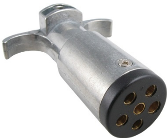
6-Pin Round Connector