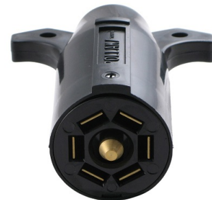
7-Pin Round RV Connector

Applications: Hunting, Marine & Boating, Camping, Emergency Services, First Responders