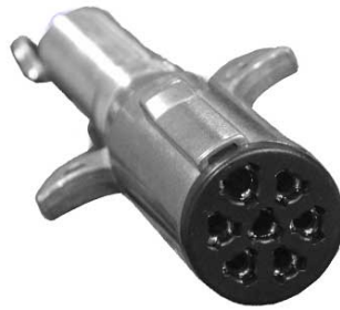
7-Pin Round Connector