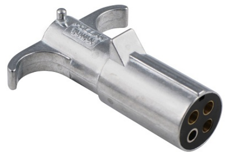
4-Pin Round Connector