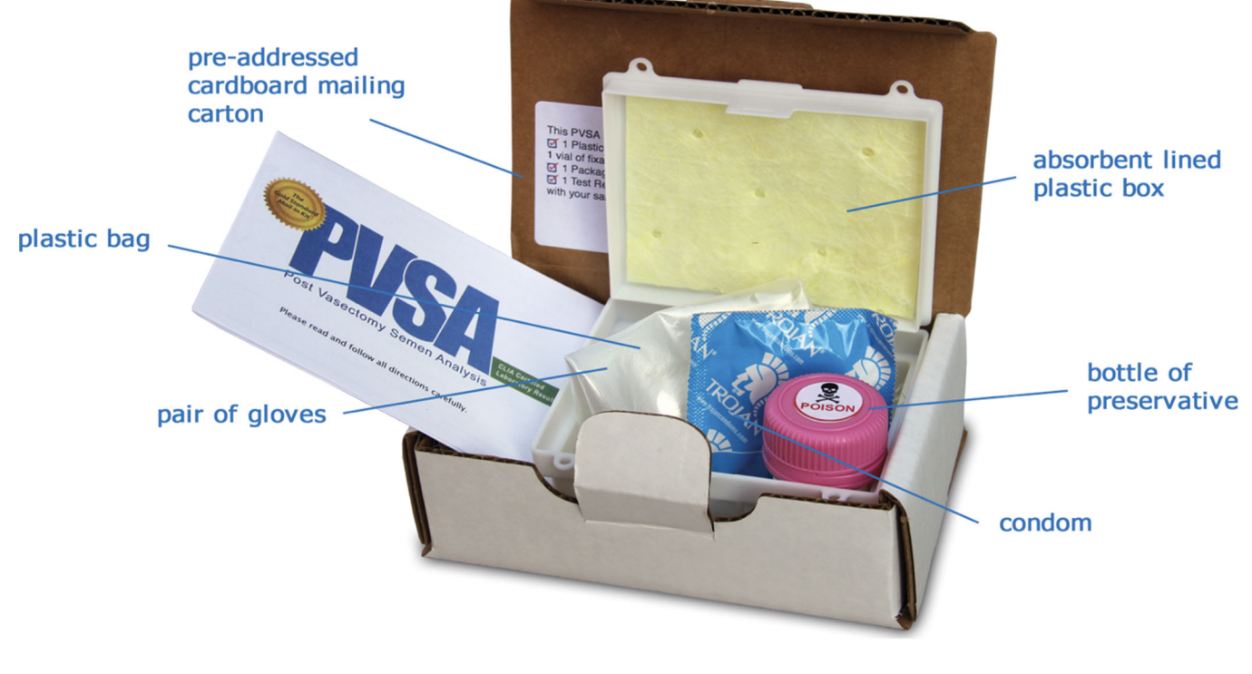
FIGURE 1 Picture of postvasectomy semen analysis (PVSA) kit

Service approved seamless plastic transport box with absorbent liners, originally designed to mail 15-ml urine specimens for testing. The instructions direct the patient to collect a semen specimen in the condom by either masturbation or intercourse, wait 30 min, then add the entire volume of the specimen to the bottle of fixative. The fixed specimen of approximately 8.5–13 ml is returned to the seamless plastic transport box with absorbent liners placed inside the pre-addressed cardboard mailer for return to a clinical laboratory for hemacytometer analysis.