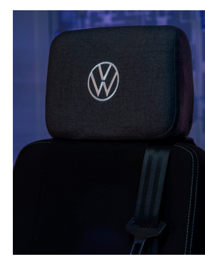
Let everyone know you're working in a Volkswagen – the best workplace on five wheels