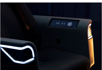
Rest your arms and play some tunes while you're at it.

With an estimated range of 12 km you can breeze to and from the coffee machine and meetings throughout the day. And with a top speed of 20 km/h you're guaranteed to be first in line for lunch. Are you one of those who'd like a bit more range? ID. Buzz Cargo has an estimated range of 423 km.